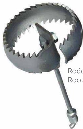
Rodding Machine Root Cutter