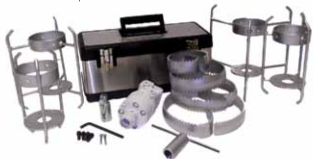
Hi-Torque Root Cutter Kit