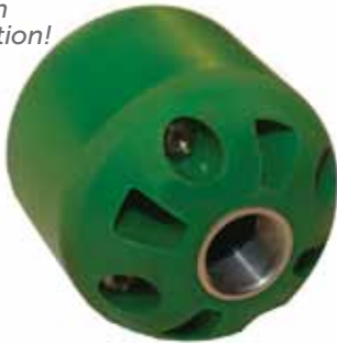
The Lumberjack® Root Cutter