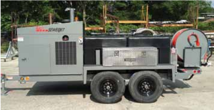
Sewer Jet 700

John Bean SewerJets help you tackle the grimeiest jobs with ease. The safest, most efficient sewer jetters available. John Bean Sewer Jets keep sewers and drains clean and clear all year long.