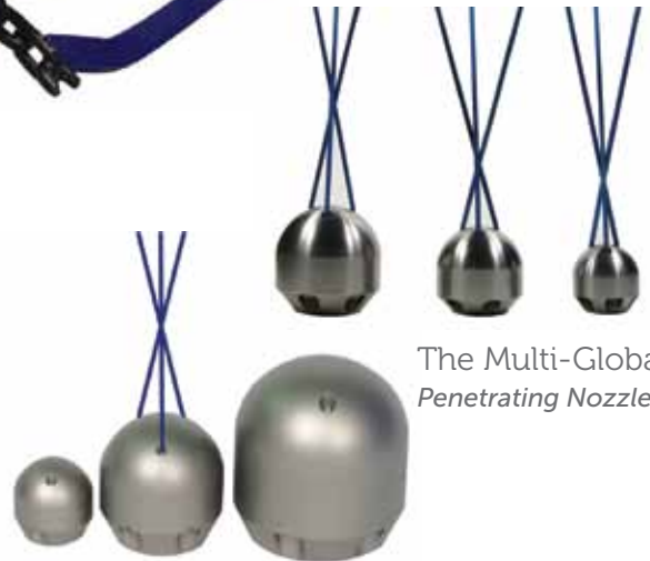
The Multi-Global™ Penetrating Nozzle