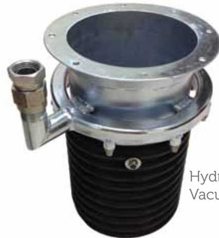
Hydro-Excavate Vacuum Attachment